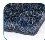
Straight Cut, Std.